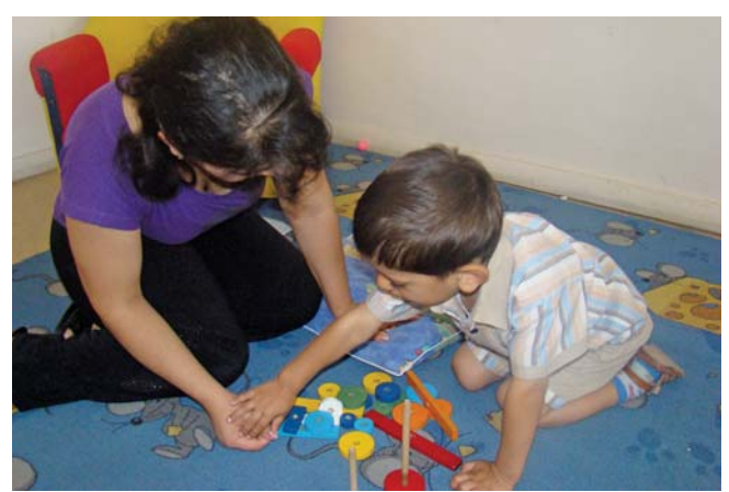
Parent supporting her child's learning at home

"For quite a long time I kept thinking that only specialists should work towards my child's intellectual development. I thought all I could do was to conscientiously take my child to special classes. It was only when I started completing the tasks assigned by the specialists together with my child, I realized that I also could contribute towards overcoming problems my son faced. This helped me to better understand my son, become his friend and teacher, and free myself of the oppressive feeling of being incapable as a parent" (Mother of a 4-year-old boy)