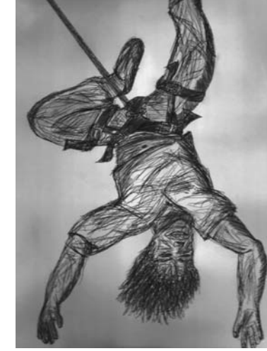
Drawing by pupil showing aerial drama

This was the name of a conference where the pupils ran a practical workshop for adults (teachers. politicians and other professionals working with or for