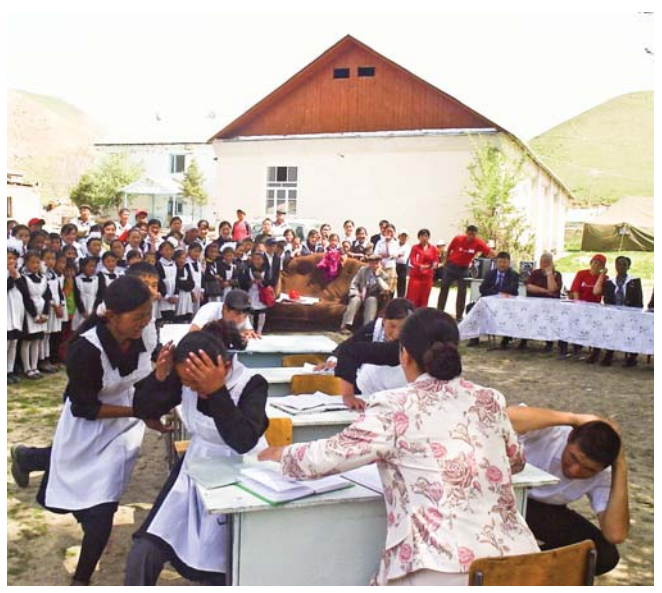
Children perform a play about the earthquake

Volunteers also identify equipment needs and 'play co-ordinators' are appointed through an election process. Volunteers have also conducted a public awareness campaign on child rights, and community members have helped volunteers to run sport, drawing and essay-writing competitions for adults and children.