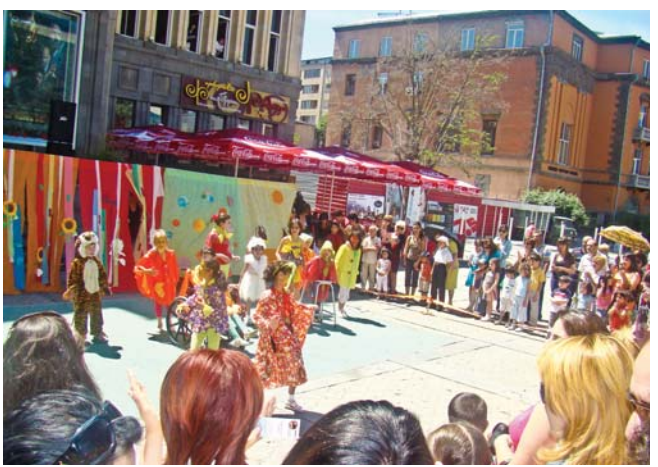
A public performance by the theatre club

On the day of the performance everyone is excited. During the performance no child is viewed as having limited capabilities, they are all real actors. Many audience members may previously have thought they should avoid children with special needs and their families. But after the performance opinions change. For some children the performance may be the first