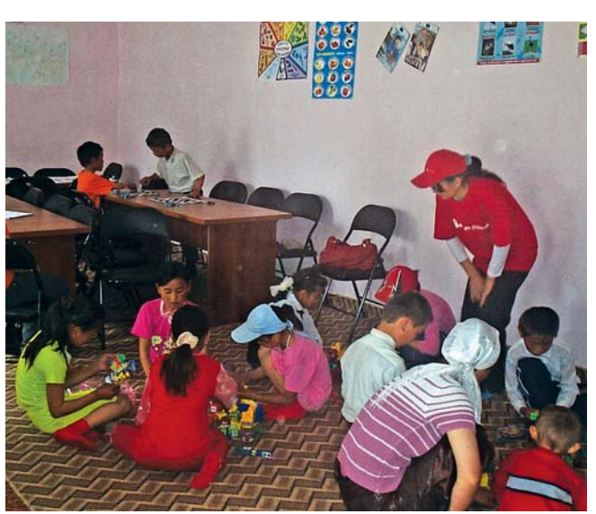
Volunteers and children in a safe play area

When we started to establish the safe play areas in the affected villages, community members didn't like the idea. Many said they didn't need playgrounds for children, they needed to rebuild their houses before winter and their children would help them with this. They said nobody would be able to use the play facilities or work as volunteers.