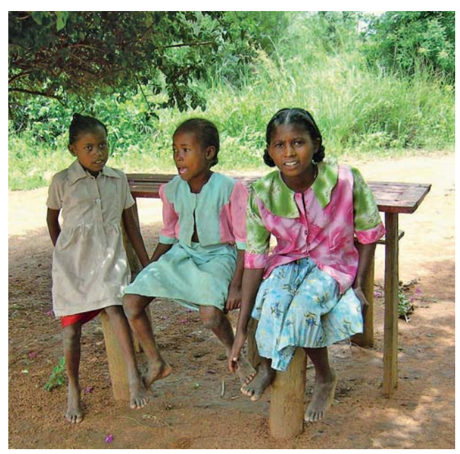
"We like our school yard. We sit here and talk about what we are doing in school.'