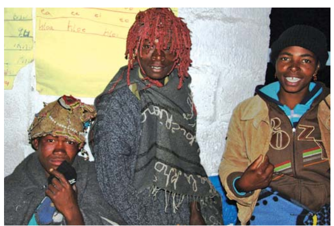
Shepherds attending the school in Semonkong

The shepherd school in Semonkong was established next to a Children's Centre which cares for 82 orphans and vulnerable children. Currently 62 shepherds attend the Semonkong school. Lessons in Sesotho, English and Maths are held Monday to Thursday, from 7pm to 10pm, after the shepherds have taken their animals to the kraal (animal pen) for the night. After lessons, students are given a nutritious meal.